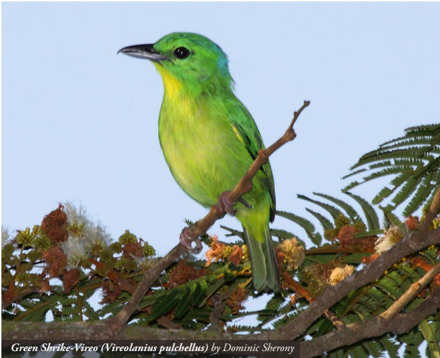
Green Shrike-Vireo ( Vireolanus pulchellus ) by Dominic Sherony

meadow, and along the riverside is exceptional. There are often good sightings of trogons, motmots, and toucans. With over 300 birds recorded at Pook's Hill, sightings of many of the less common species such as the Spectacled Owl, Emerald Toucanet, and Tody Motmot are also a good possibility. Explore the socio-economic factors associated with conservation while engaging with the locals from the lodge regarding conservation and habitat protection processes. Then, this evening, optional night walk may yield Black-and-white or Spectacled Owls. Overnight at Pook's Hill Lodge. (BLD)