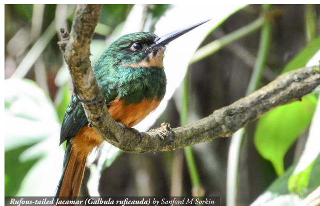
Rufous-tailed Jacamar ( Galbula ruficauda)

Depart early for morning birding at Cockscomb Basin . In the late afternoon, return to the lodge and bird along the trails for Pheasant Cuckoo, Rufous-tailed Jacamar, various hummingbirds, woodcreepers, flycatchers, Nightingale Wren, Green Shrike Vireo, Green Honeycreeper, White-winged Becard and Passerini's Tanager to name a few. Overnight at Bocawina Rainforest Resort. (BLD)