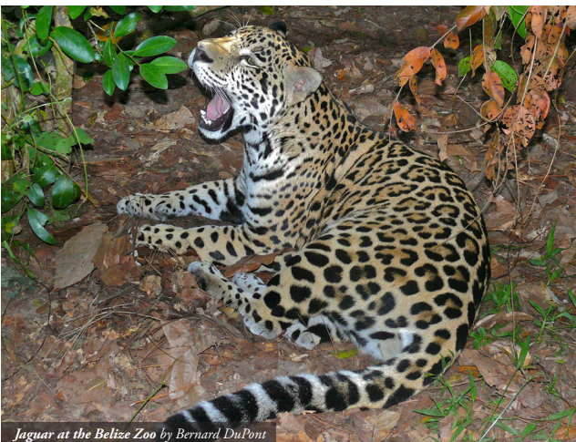
Jaguar at the Belize Zoo by Bernard DuPont

Early morning birding and then group transfer to the airport for flights back to U.S. Please make sure flights depart after 12:00pm. (B)