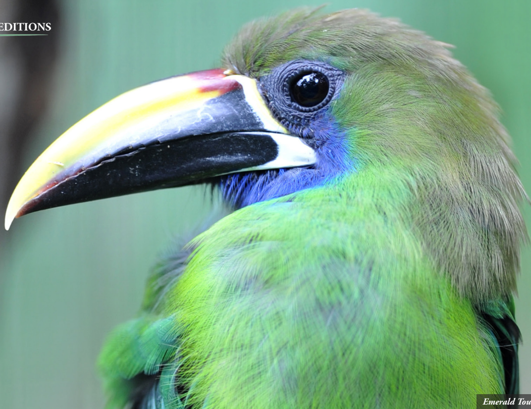
Emerald Toucanet ( Aulacorhynchus prasinus )