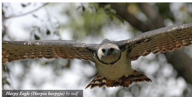
Harpy Eagle ( Harpia harpyja ) by mdf