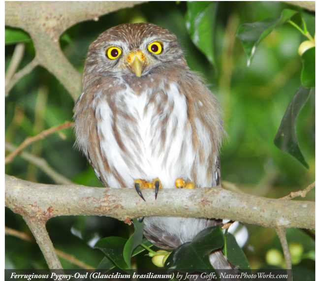
Ferruginous Pygmy-Owl ( Glaucidium brasilianum)