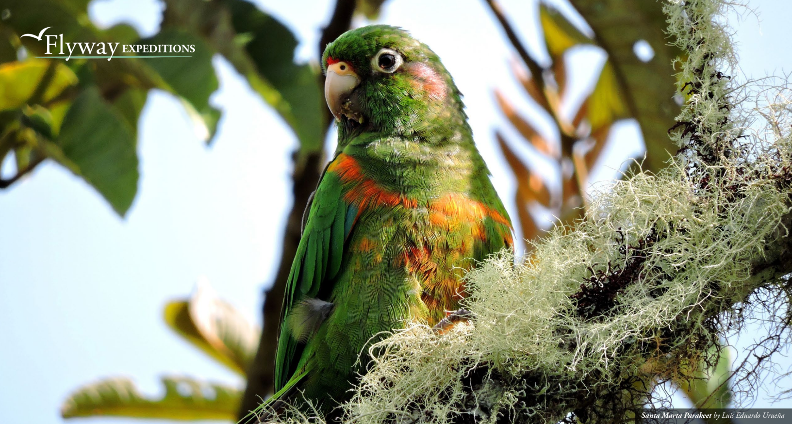
Santa Marta Parakeet