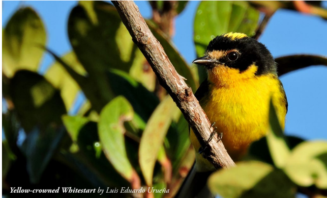
Yellow-crowned Whitestart