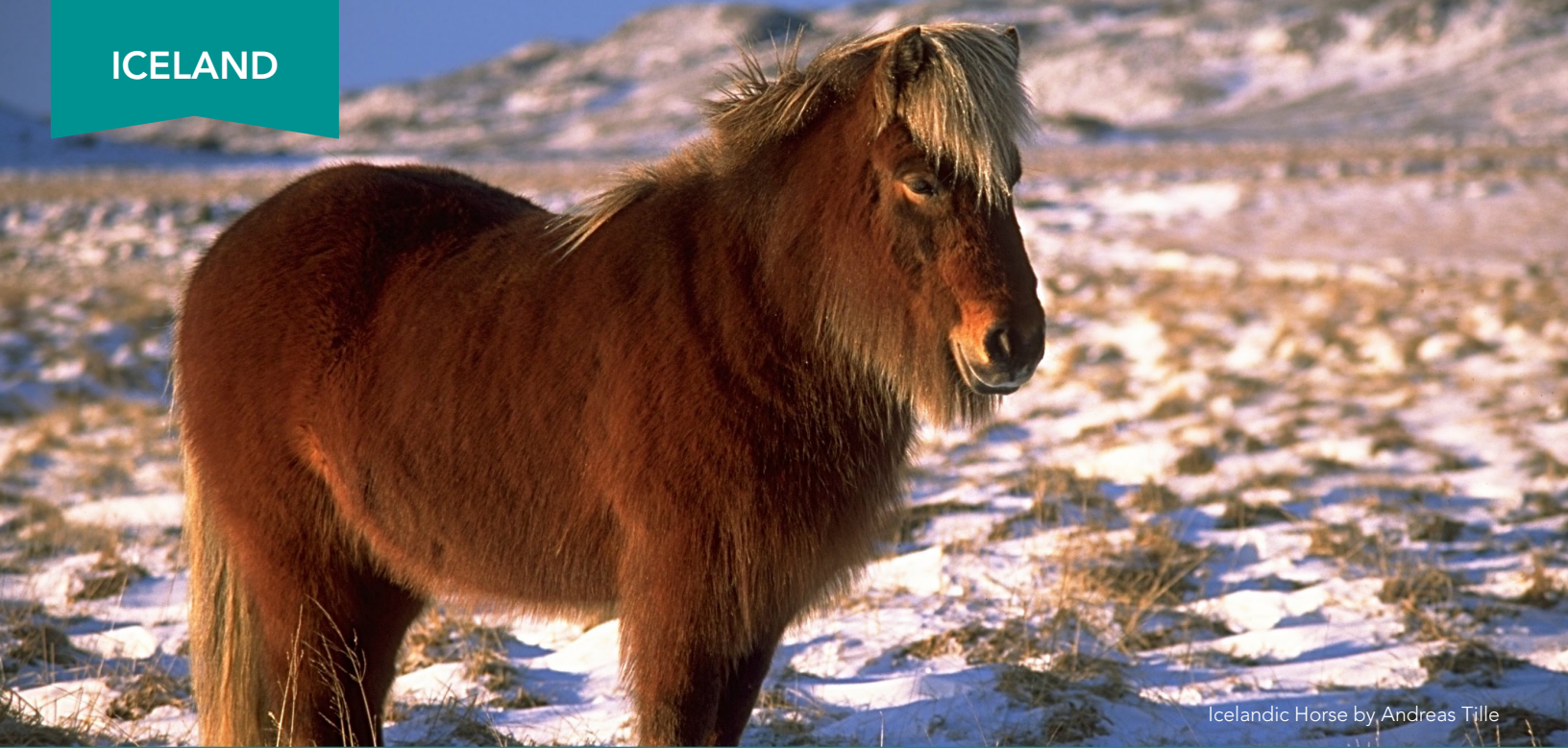
Icelandic Horse