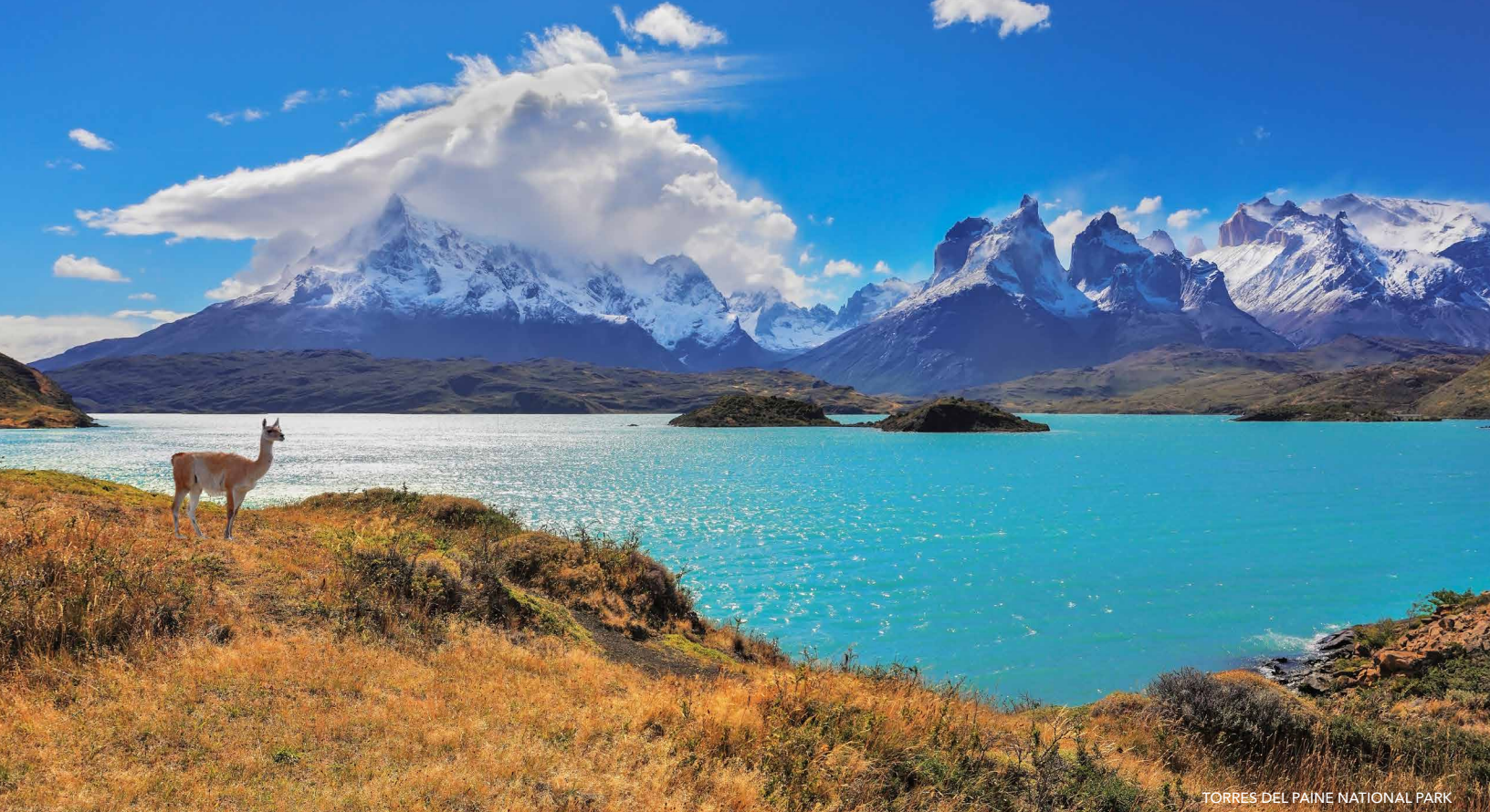
TORRES DEL PAINE NATIONAL PARK