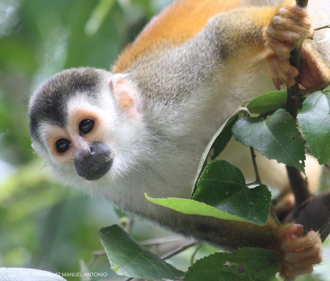
SQUIRREL MONKEY AT MANUEL ANTONIO