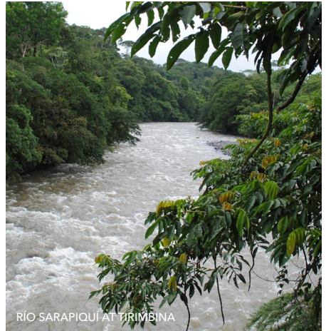
RÍO SARAPIQUÍ AT TIRIMBINA

during a hike in the Carara Biological Reserve. Experience double the diversity exploring this forest, which overlaps Pacific rainforest and tropical dry forest. Next, explore the famed Tárcoles River for an up close and personal experience with the massive crocodiles that inhabit these waters. Return to the lodge for lunch and then hike along the hotel's canopy walkway, a suspended bridge situated in the forest canopy. This evening there will be a lecture on macaws and crocodiles, followed by a night walk to look for kinkajous and other nocturnal creatures. Overnight at Hotel Villa Lapas. (BLD)