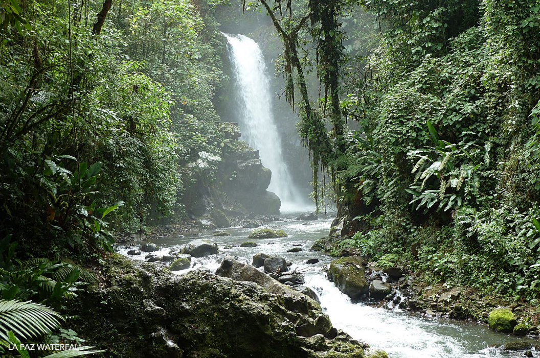
LA PAZ WATERFALL

WHY COSTA RICA? With one-fourth of its land mass under preservation, Costa Rica encompasses 12 climatic zones along mountains, forests, ocean, and coast, and boasts nearly 4% of the world's biodiversity – despite spanning just 0.03% of the earth's surface.