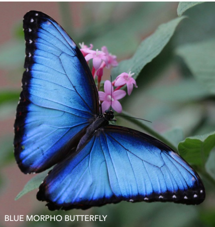
BLUE MORPHO BUTTERFLY

After an early morning breakfast, hike the Selva Verde Rainforest Reserve. After lunch, take a nature boat ride on the Sarapiquí River. The journey will introduce the birds and animals that frequent the riverine vegetation, including caimans and a variety of water birds. A site lecture during the boat ride will draw attention to the land use on the river banks and the human impact on the ecology of the river system. Return to the lodge for time to relax and enjoy the amenities of the lodge. Overnight at Selva Verde Lodge & Rainforest Reserve. (BLD)