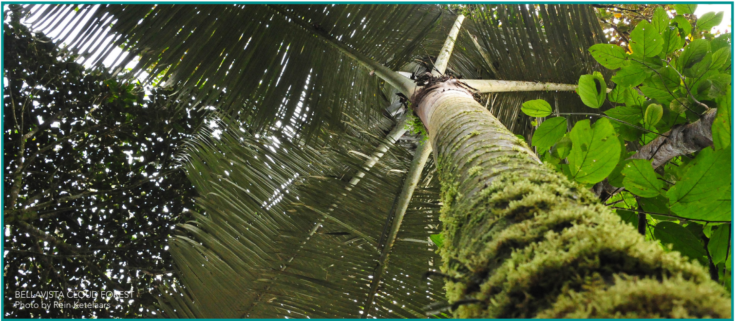
BELLAVISTA CLOUD FOREST