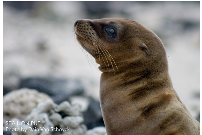
SEA LION PUP

work you will be assisting with measuring, and attaching a chip to the shell which will be used for future scanning and monitoring. This project is for the purpose of establishing information about the health and populations of tortoises in their natural habitat. Afterwards group reflection on the monitoring done today. Overnight at Villa Laguna. (BLD)