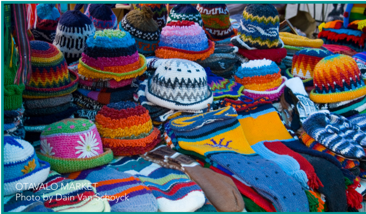
OTAVALO MARKET