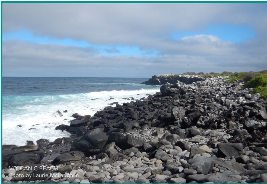
VOLCANIC BEACH