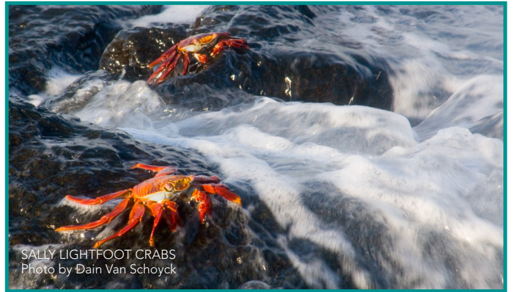
SALLY LIGHTFOOT CRABS