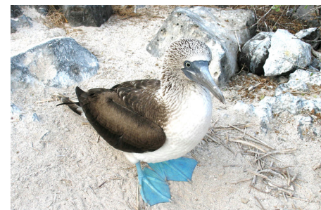
Blue-footed Booby