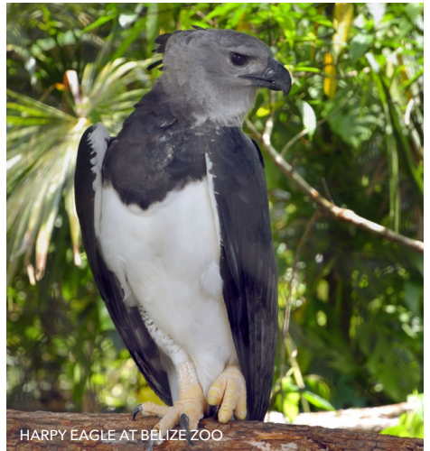
HARPY EAGLE AT BELIZE ZOO