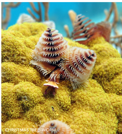
CHRISTMAS TREE WORM

Following breakfast, we will visit the very popular St. Herman’s Blue Hole National Park which is within the Sibun Watershed. Explore its forests and unique geological features and then also visit, a sunken underground cave that is approximately 300 feet wide and 100 feet deep by tube. There is an onsite changing room so bring your swimsuit! Have lunch at local restaurant then later this afternoon check-in at the beachfront Jaguar Reef Lodge. The remainder of the day is at leisure to enjoy beach activities. This evening we have a lecture on the Belize’s amazing coral reef. Overnight at Jaguar Reef Lodge (BLD)