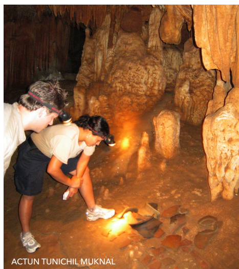
ACTUN TUNICHIL MUKNAL

“Cathedral” chamber, which was a Maya ceremonial and burial ground. The lodge is the nearest one to the cave, providing the opportunity to get into the cave early before other visitors arrive. Later this afternoon, return to the lodge. Before dinner, meet a special guest, a Mayan descendant who will share stories of her family and traditions. Overnight at The Lodge at Chaa Creek (BLD)