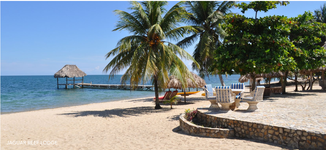
JAGUAR REEF LODGE