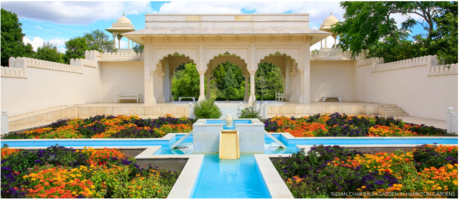
INDIAN CHAR BAGH GARDEN IN HAMILTON GARDENS