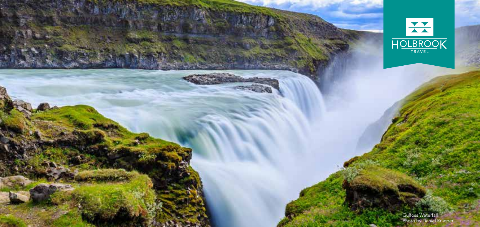
Gullfoss Waterfall