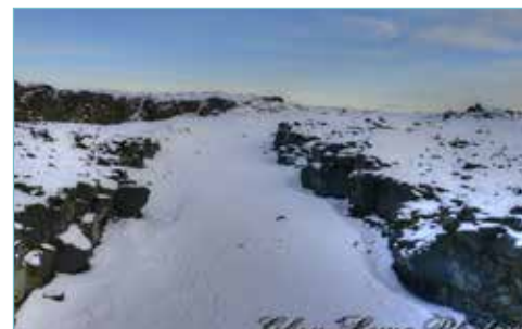
MID-ATLANTIC RIDGE BY GLYN LOWE