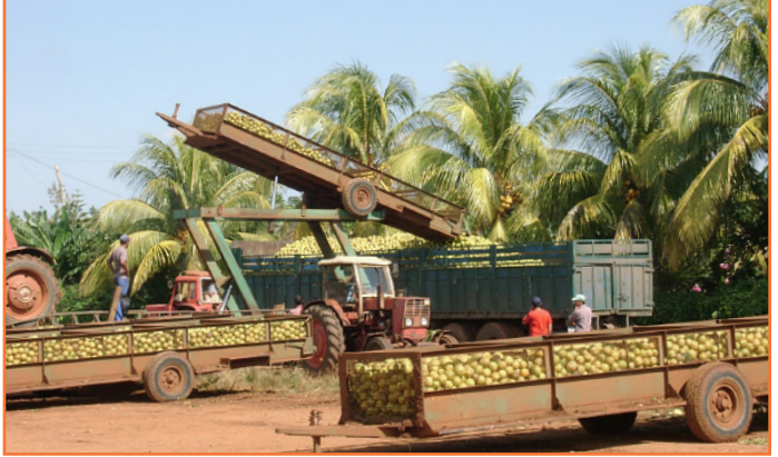
Grapefruit harvest, "UBPC 9 de Abril" cooperative near Coralillo, Artemisa. (2002)