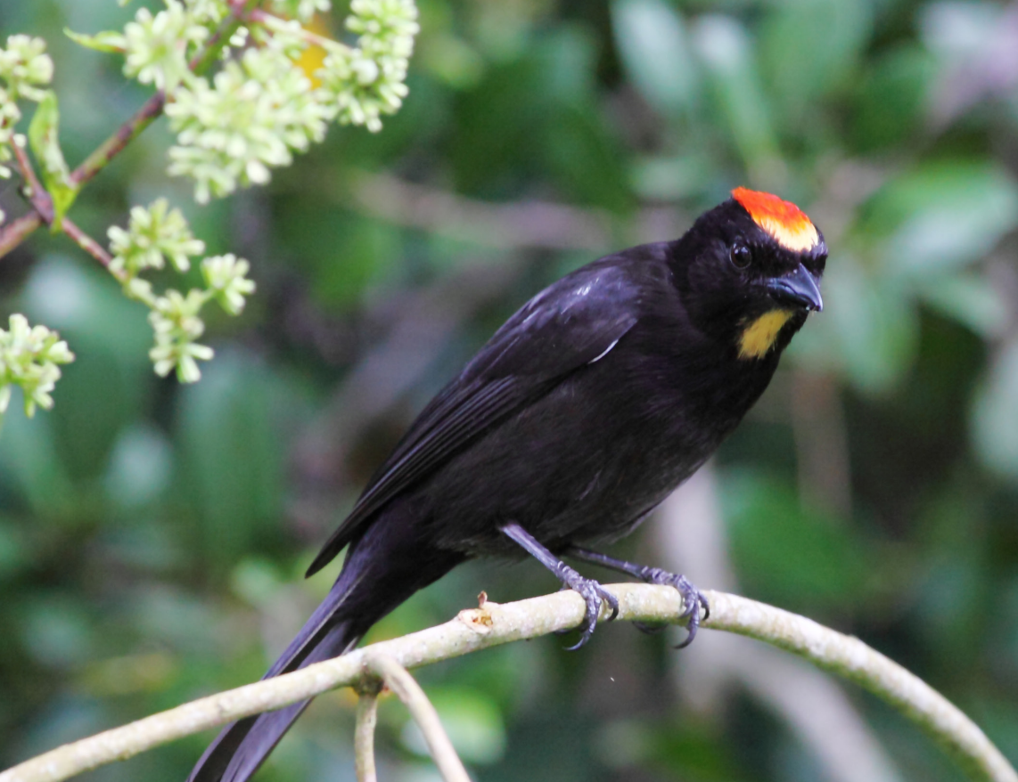
Flame-crested Tanager