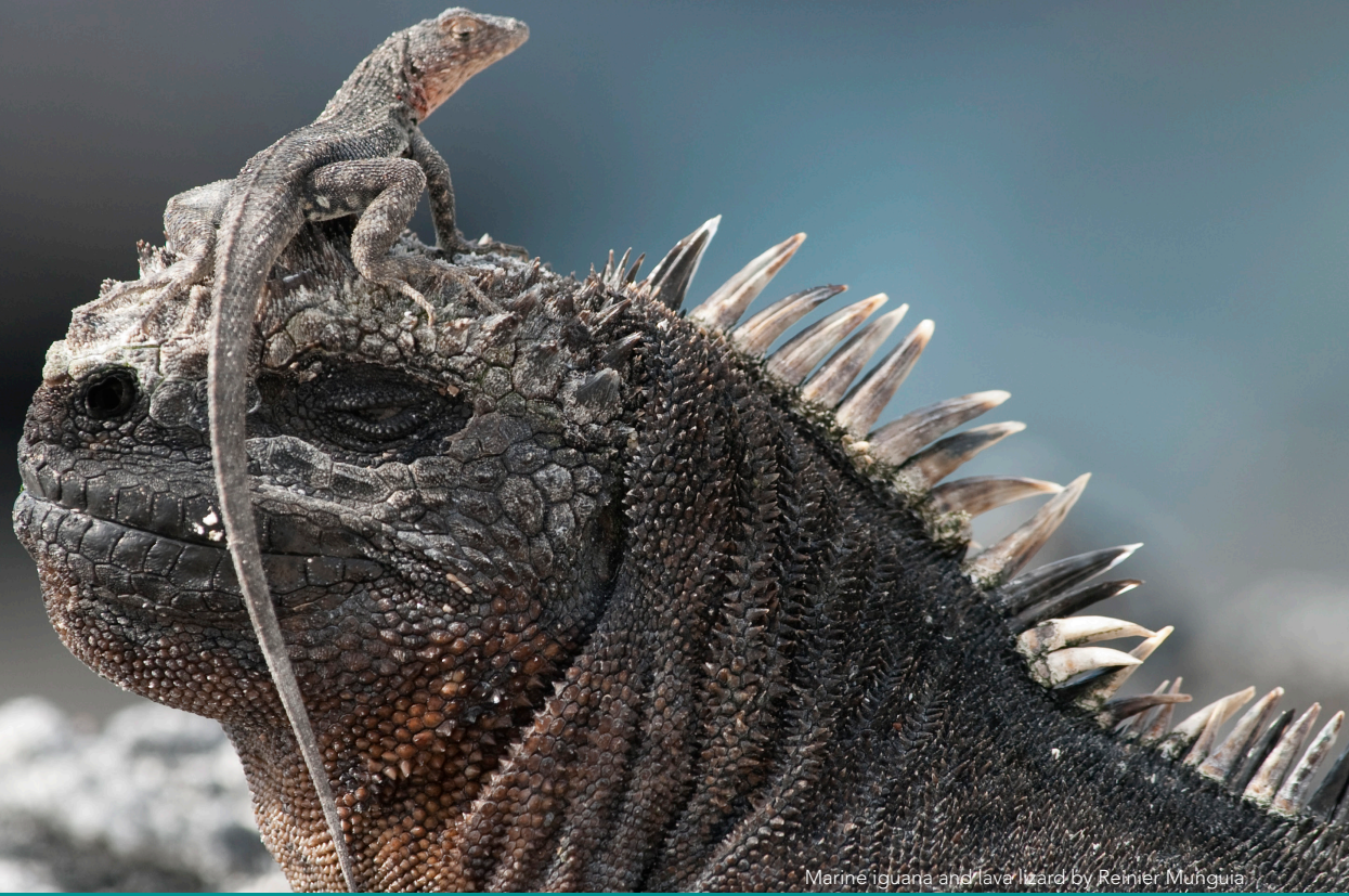
Marine iguana and lava lizard