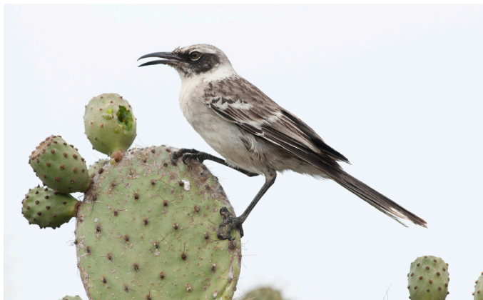
Mockingbird by Reinier Munguia