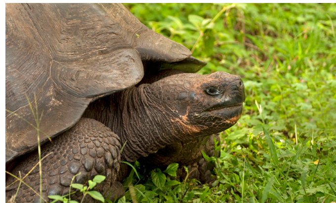
Giant tortoise